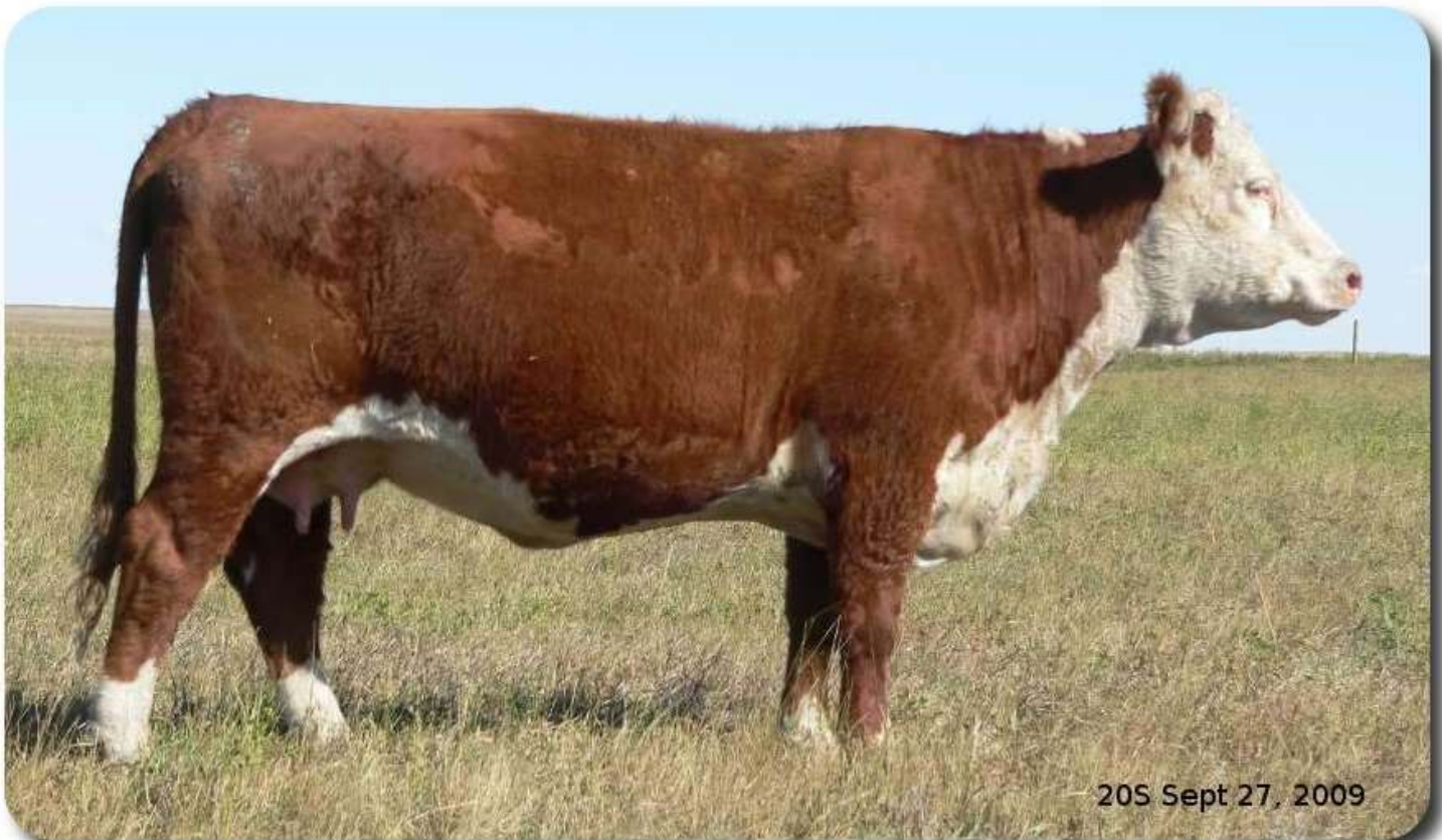
LBH 87M MISS DIAMOND 20S, dam of 40W