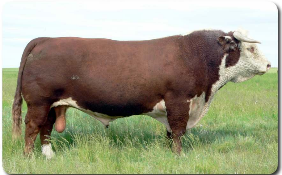
K 64H RIBSTONE LAD 157K, sire of 40W.