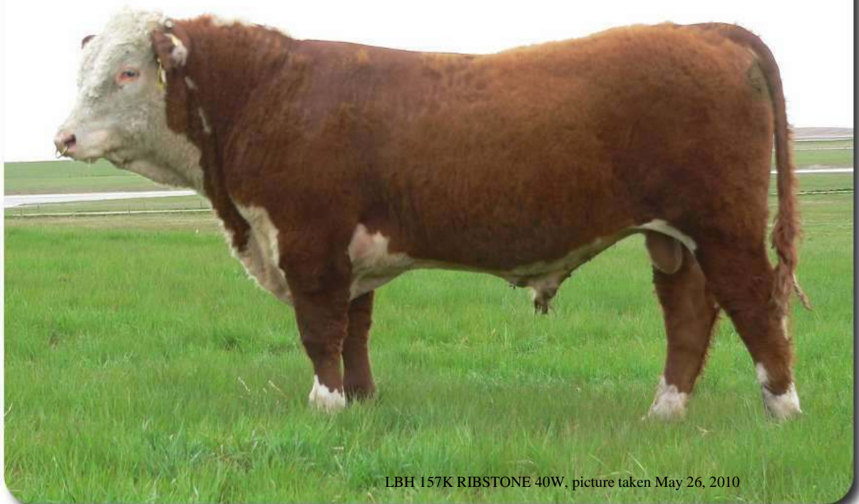
LBH 157K RIBSTONE 40W, picture taken May 26, 2010