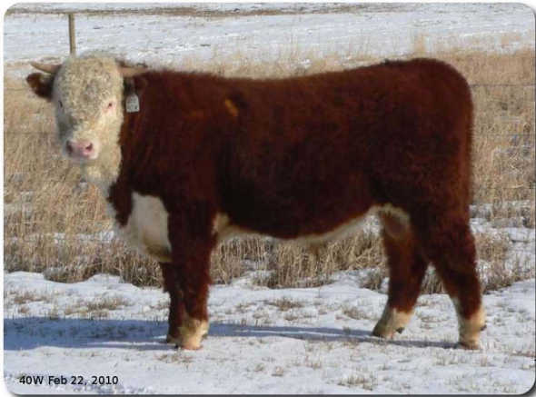
40W Feb 22, 2010

Regn.#: C02928516 Sex: Male Tattoo: LBH 40W Birth Date: 07/02/2009 Regn. Status: Registered Horn: Horned Breeder: LILYBROOK HEREFORDS INC Current Owner: LILYBROOK HEREFORDS INC Performance: BW:93 Adj:96 Ind:96 WW:816 Adj:786 Ind:118 YW:1075 Adj:1111 Ind:0